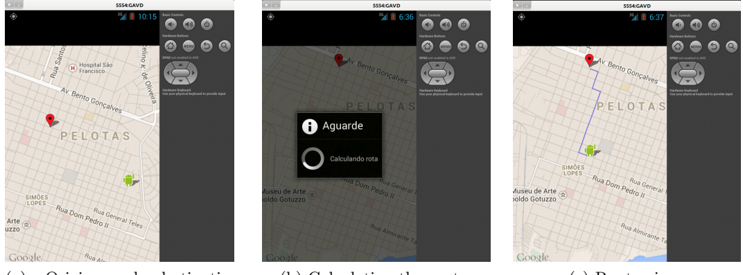
(a) Origin and destination points

A service responsible for connecting the application to the GPS, receiving location information periodically every 30 seconds, which can be set remotely from the WebService was created in the first stage of the work. After receiving the information, Service sends it to the WebService, keeping the historical database and pheromones. The application prototype interface is shown in Figures 1a, 1b and 1c.